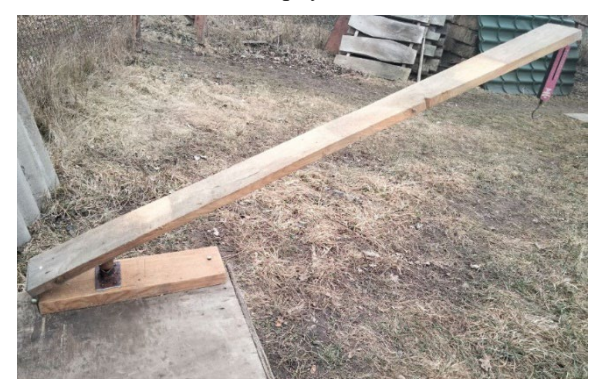
Figure 6. Laboratory equipment for determining the strength characteristics of walnut fruit

To determine the strength characteristics, the author designed and manufactured a device ( Fig. 6 ). It consists of a lever mechanism and a deforming device. The dimensions and load measurements were carried out according to well-known methods of physical mechanics.