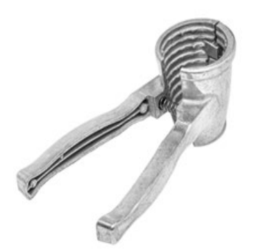
Figure 2. Hand tools for cracking walnuts

The principle of operation of such devices is to manually press the handles, which leads to the destruction of the shell of a properly installed nut in a specially designed seat. The compression force and, accordingly, the force exerted on the shell directly depends on the user.