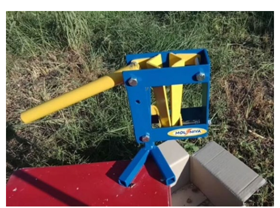
Figure 3. Improved manual walnut cracker Source: [20].

A more advanced machine, recommended by the authors for industrial volumes of walnut kernel processing, is a walnut hulling machine by Etalon [21] ( Fig. 5 ). It is a machine for fast and productive walnut cracking, which is used at large and medium-sized enterprises. It differs from other industrial walnut crackers by the ability to work without calibrating the nut and maximum productivity. This model of walnut cracker uses a cone type of cracking, which allows for a whole kernel yield of up to 80 %.