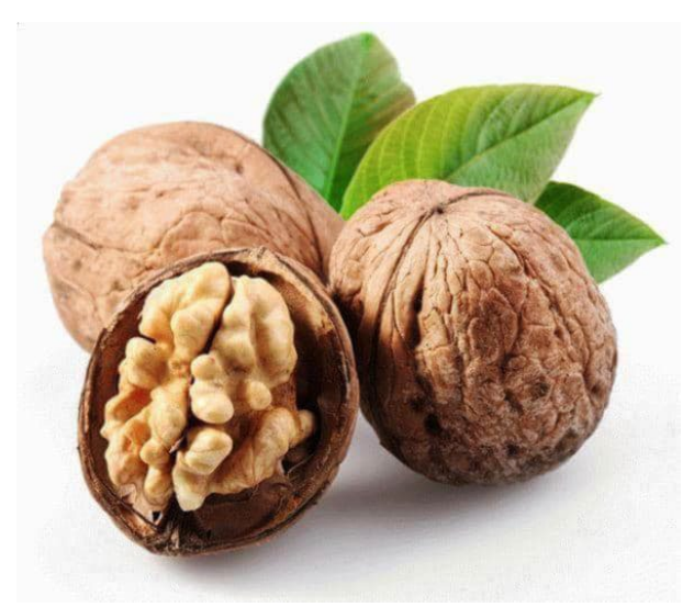
Figure 1. Walnut (Juglans regia) Source: [19].

Nuts are not only a delicious snack. They are rich in carbohydrates, fats, proteins, vitamins, iron, potassium, magnesium, phosphorus, zinc, copper, manganese, etc., so they are very useful for the body and have a beneficial effect on various organs and systems: They stimulate brain function, improve memory and concentration, have a positive effect on the heart and cardiovascular system, strengthen the walls of blood vessels, normalize cholesterol levels, prevent diabetes, reduce the risk of bowel cancer, boost immunity, etc [18].