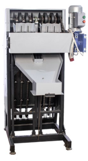
Figure 5. Nut sheller for industrial use Reference Source: [21].

A more productive machine based on the principle of crimping is the machine proposed in Fig. 4 .