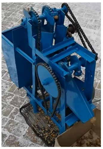
Figure 4. Mechanized device for cracking walnut shells (for non-industrial production volumes)

To simplify the operation of the mechanisms, a manual mechanism of improved design is proposed ( Fig. 3 ). The walnut fruit is crimped using a lever mechanism in a cone-type press [21].